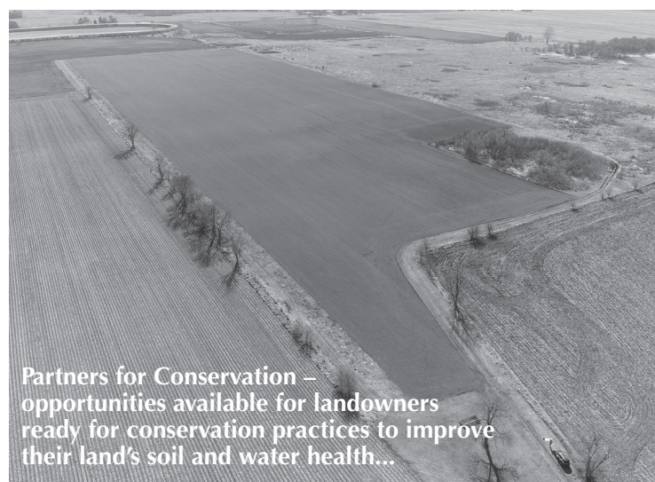
Partners for Conservation - opportunities available for landowners ready for conservation practices to improve their land's soil and water health...

Funds are currently available in partnership with the Illinois Department of Agriculture. This first round of 2024 funding closes April 8. Contact us to explore your options - email contact@kanedupageswcd.org or call 630-584-7960 ext. 3