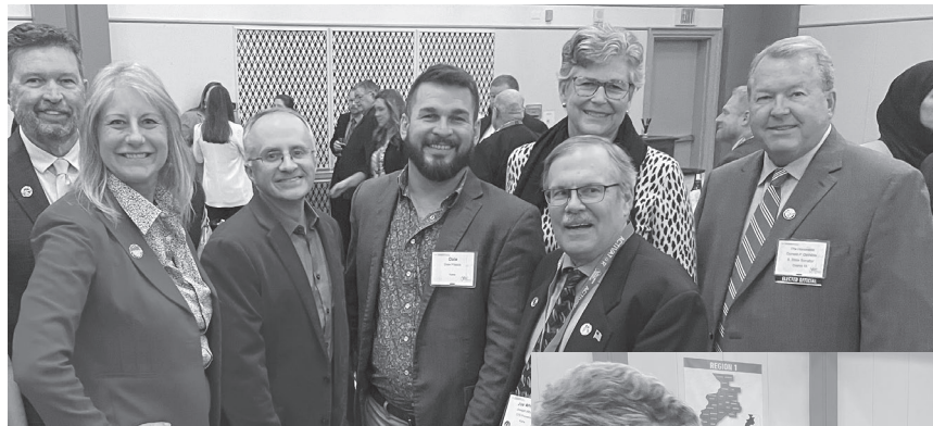
Left: KCFB Leaders and State Legislators had the chance to mingle at the annual Statewide Legislative Reception that is a part of the Governmental Affairs Leadership Conference.