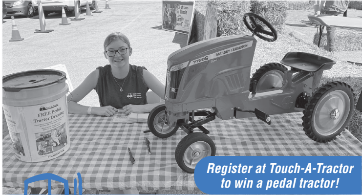
Register at Touch-A-Tractor to win a pedal tractor!

Hours are noon-4pm on Friday, 10am to 4pm Saturday, and 10am to 3pm Sunday. Admission to the event is a donation of $5 per family or $2 per adult (children 18 & under free). Funds will be used for college scholarships and agricultural literacy programs. A Vintage Truck Raffle ticket stub will also gain you FREE entry for your family.