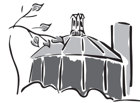
Little Lending Library

Little Lending Library that we can help bridge the gap between consumer and farmers and help