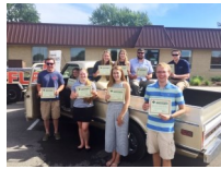
Nine scholars gather round the Vintage Truck Raffle prize after 2020's scholarship awards ceremony.

Awarded to students of KCFB members pursuing higher education for degrees and careers in agricultural fields of study. Five recipients received scholarship awards of $1,000 to $1,250 for college this fall.